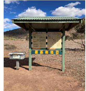
Now in a better position