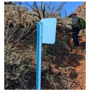
Wot, no decal?