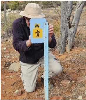
Improving visibility in a remote spot