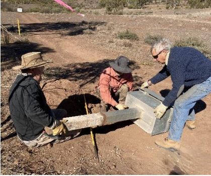
Just three to move the leaflet box at The Dutchman