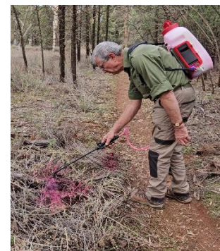
... different for feral horehound